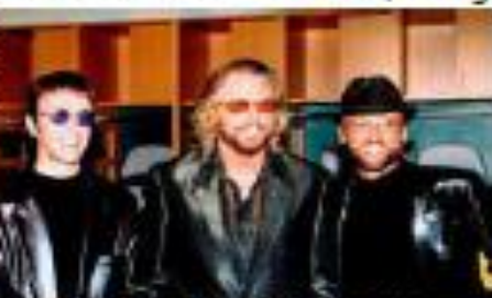
The Bee Gees Megastars