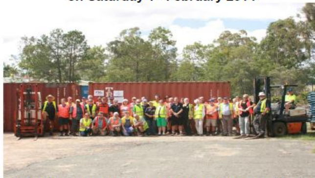
The 750 th with volunteers in attendance on the day