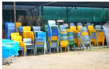
Some of the Furniture Ready for Packing

The last container to Honiara was a project of the Rotary Club of Pine Rivers Daybreak. The container was packed in the first week of January so that the container would arrive in Honiara prior to the arrival of a team of volunteers from the Club on 12 th February. The team planned to clear the container and deliver it to the school for unpacking and installing the furniture in the school.