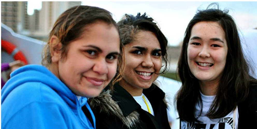
Students at International House, UQ

Forty-five young people were involved in the 2013 IYLC at International House in July. Mentors and mentees engaged in a variety of personal and professional development activities at the university and around Brisbane to increase their interest and encourage them to apply for tertiary education at the end of Year 12.