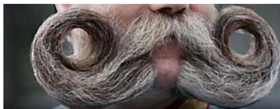
Beard and Moustache Appreciation Rotarian Fellowship

Rotary Fellowships are international groups that share a common passion. Being part of a fellowship is a fun way to make friends around the world, join a global community built around a hobby or profession, and enhance your Rotary experience.