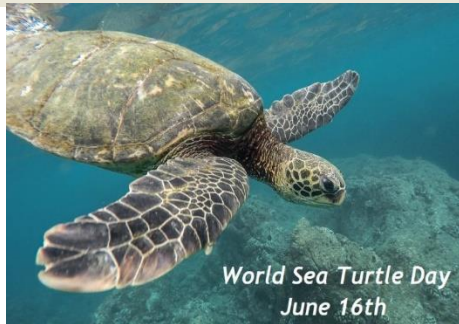
World Sea Turtle Day June 16th