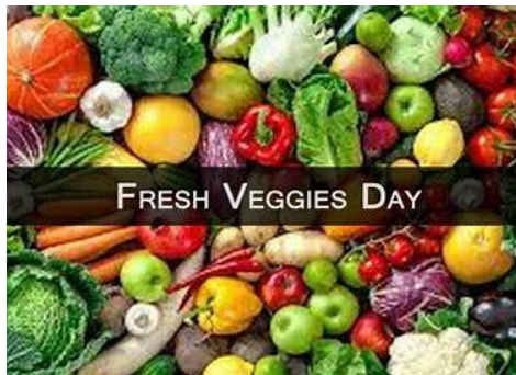
FRESH VEGGIES DAY