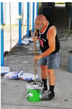
Always the stirrer!