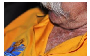
Awful selfie attempt