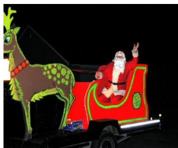
Rotary Club of Carnforth (England), Rotary Club of Dronfield (England),