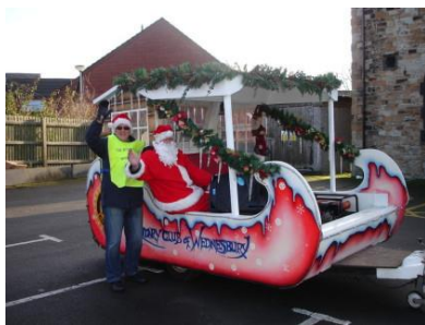
Rotary Club of Wednesday (England), Rotary Club of Chislehurst (England),