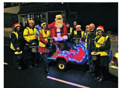
Rotary Club of Bloxwich (England) Rotary Club of Hyde (England)