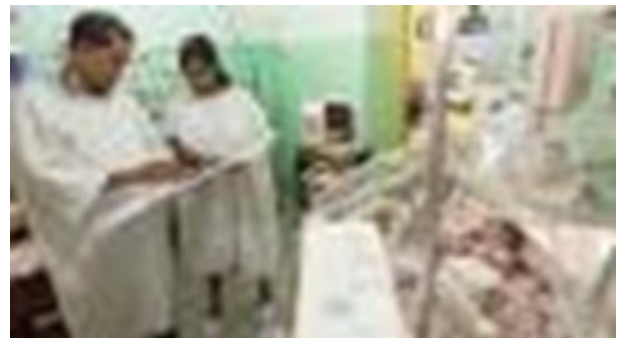
Rotarians equipped the neonatal intensive care unit. More than 160,000 babies have been delivered in the hospital since Rotarians became involved.