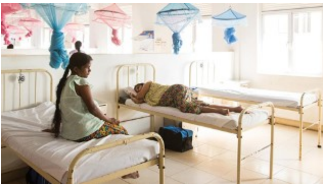
A member of the Rotary Club of Colombo designed some of the new buildings.

The project has included many steps over the years: first, operating rooms and intensive care units for mothers and babies; then the prenatal wards; and, finally, training. Jeska-Thorwart, whom Rotary honored as a Global Woman of Action at the United Nations in November, says they plan to celebrate the completion of the project in January 2017.