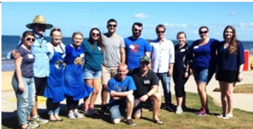
The North Lakes Rotaract Team who helped stage this successful fundraiser.. Who IS that stranger in the front